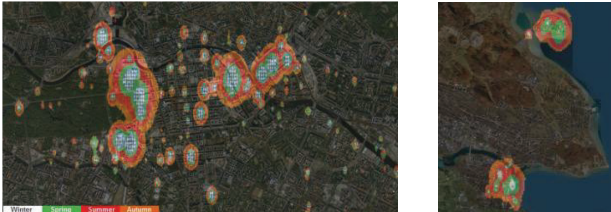
Figure 2. Location and seasonal differences of photos taken in Berlin (left) and Konstanz (right): more places of interest are identified in Berlin, and the small size of the white region in Konstanz indicates that this region is mostly visited during the warm seasons, whereas Berlin is visited all year round [6].