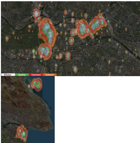
Figure 1. Growth Ring Maps showing the seasonal differences of taking photos for Berlin (left) and Konstanz (right). The small amount of white color in Konstanz indicates that warm months are more popular at this region, whereas Berlin is visited all over the year.

The Growth Ring Maps technique supports the exploration of the frequencies and temporal patterns of events occurring in the same places. For the Panoramio dataset, we defined the significant places on the basis of the density-based spatial clustering of the events. For each place, we represent the photos made in it by pixels placed around the central point in an orbital layout according to the times of taking the photos: the earlier the photo was made, the closer the pixel is to the central point. Color-hue is used to map semantic properties of the events or places. Thus, seasonal differences in visiting the places may be investigated by mapping the seasons to four distinct colors (winter-white, spring-green, summer-red, and autumn-orange). The resulting Growth Ring Maps show simultaneously the intensity of taking photos at different locations and the seasonal differences. Figure 1 presents the results for Berlin and Konstanz. While Berlin is visited through the whole year, Konstanz appears as a popular place in the warm season, as indicated by the Growth Rings with very little amounts of white color.