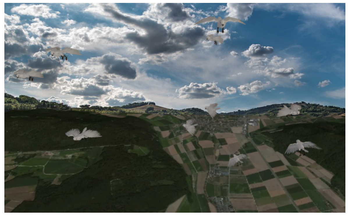
Figure 3: The GPS coordinates of tracked birds were projected into a virtual environment to analyze their behavior in a thermal spiral. From the eyes of a bird, you can see how other birds use the thermal spiral to move upwards in a circle. Also, the data is enriched by providing the surrounding landscape to recognize further factors which influence the behavior of birds. Using this visualization, it was possible to detect that specific winds, represented by cloud movement, could be responsible for a certain pattern in bird movement, which was previously not explainable.

you can see a part of the virtual environment out of the eyes of a bird. The current satellite image which matches the GPS position of the bird is located at the bottom so that users can always see the exact surroundings. This includes information like the height of the mountains as well as the land usages. The reason for displaying satellite images and elevation data is that thermal spirals behave differently, whether they occur over mountains or flat areas. The projection into a simulation enables experts to recognize missing features like the weather information.