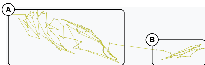
Figure 2: Somchair sensor t-SNE projection (A) measurements taken from 11/2009 until 11/2015, and in (B) from 1/2016 until 12/2016. The two clusters indicate that between (A) and (B) there was a change in the chemical contamination in this area. We assume that there was environmental pollution in this area in December 2015 since there was an increase in the chemical Methylsoline.