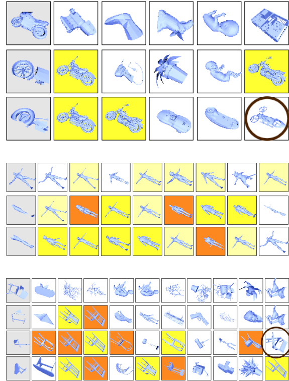
Figure 2: Example global (top row) and partial (bottom rows) queries for different KNDB query objects.

Figure 3 shows a query for an object from the ESB data set. The figure shows all 8 partial queries simultaneously. It can be seen that, in addition to the relevant objects returned by the original query (top row), the partial queries (rows 2 to 9) yield additional relevant objects not revealed on the first 12 and 96 positions of the original query. Note that the additional relevant answers comprise the same structure as the relevant objects from the global query, yet they show certain extensions to their main structure which prevented them to be retrieved by the global query.