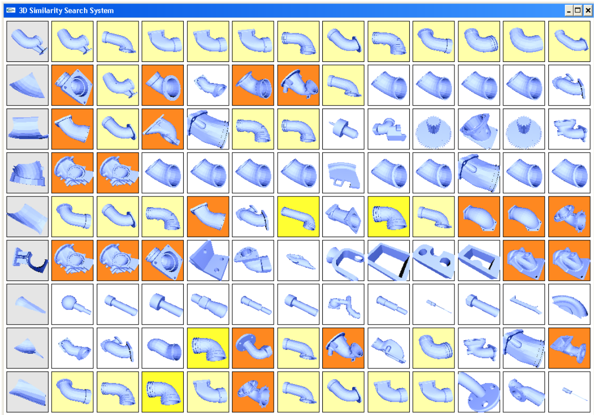
Figure 3: Global (row 1) and local (rows 2 to 9) query results for an examples ESB query. The answers to the partial queries provide additional relevant objects not provided by the global query alone.

vanced result visualization techniques, e.g., based on cluster analysis, are considered promising.